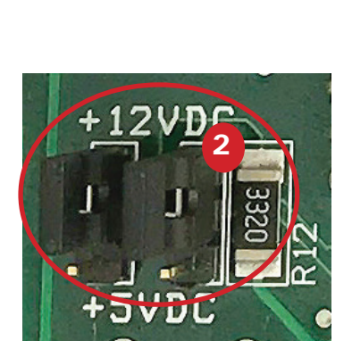
FIGURE 2 Keypad replacement (Pins factory set for Magnum Revision 7 or higher, +12 VDC)

PROPER WIRING FOR KEYPAD ON REVERSE SIDE OF THIS SHEET